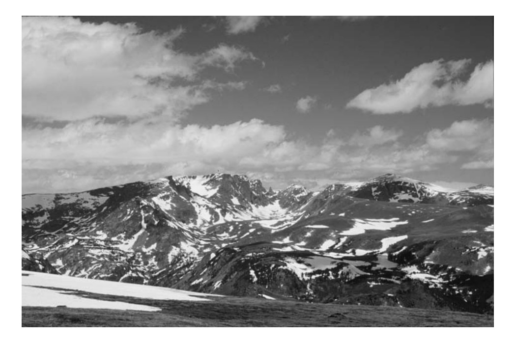
FIGURE 1. Panorama of the Beartooth Plateau alpine zone in the Northern Rocky Mountains, U.S.A.

and moist until processing. To observe fungi, roots were cleared by simmering in a 10% KOH solution for 3 min, rinsed in tap water for 20 min, simmered in a 5% ink and vinegar solution for 3 min., and rinsed in tap water for 5 to 10 min., following a technique from Vierheilig et al. (1998). Roots were examined under a dissecting scope for ectomycorrhizae and possible colonization of endomycorrhizae. Selected root lengths were mounted on microscope slides and examined under a compound microscope for infection. Levels were not quantified in detail, but particular roots were visually accessed for the extent of mycorrhizal colonization relative to the total root length. If diagnostic hyphae or other mycorrhizal structures were present in a few areas, it was considered lightly infected (+), twice that was considered medium (++), and if a majority of the root was colonized, it was considered a heavy infection (+++). Semipermanent slides were made of infected roots using glycerol as a mounting medium and nail polish to seal edges. These are housed in the MONT Herbarium at Montana State University with dried plant vouchers.