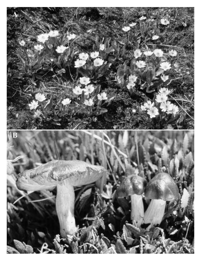
FIGURE 3. Organism level symbiosis. (A) Caltha leptosepala hosts arbuscular mycorrhizal fungi in its roots. (B) Dryas is ectomycorrhizal with mushroom-producing fungus Entoloma alpicola.